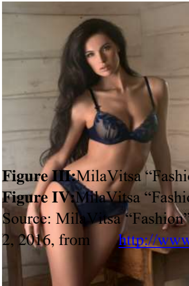
Figure III: MilaVitsa “Fashion” Collection 2016