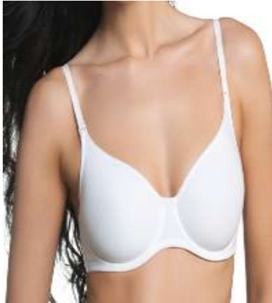
Figure I: MilaVitsa “Classic” Collection 2016 Figure II: MilaVitsa “Classic” Collection 2016

designs of lingerie were arbitrary selected by the researchersto reflect the typical perceptions of both so-called ‘simple’ cotton and ‘sexy’ lace lingerie.